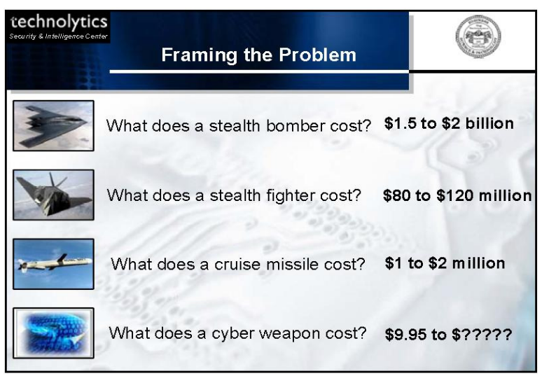
Figure 1 – Comparing the costs of a cyberweapon to other modern weapons (Technolytics, 2011).